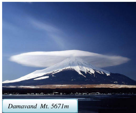
Damavand Mt. 5671m

Its diverse nature and climate include plains, rangelands, and forests ranges from the sandy beaches to the rugged and snowcapped Alborz sierra with the highest peak and volcano throughout Middle-East and Western Asia, Mount Damavand which at the narrowest point (Nowshahr County) narrows to 5 miles and culminates less than 2000 meters from the coast.